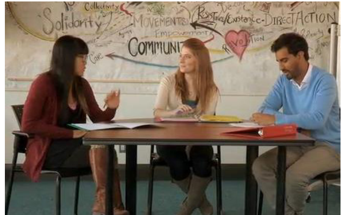
One of the REDI tutorial's nine new videos 'Allyship' depicts a situation in which students are planning an event in a venue which is not accessible.